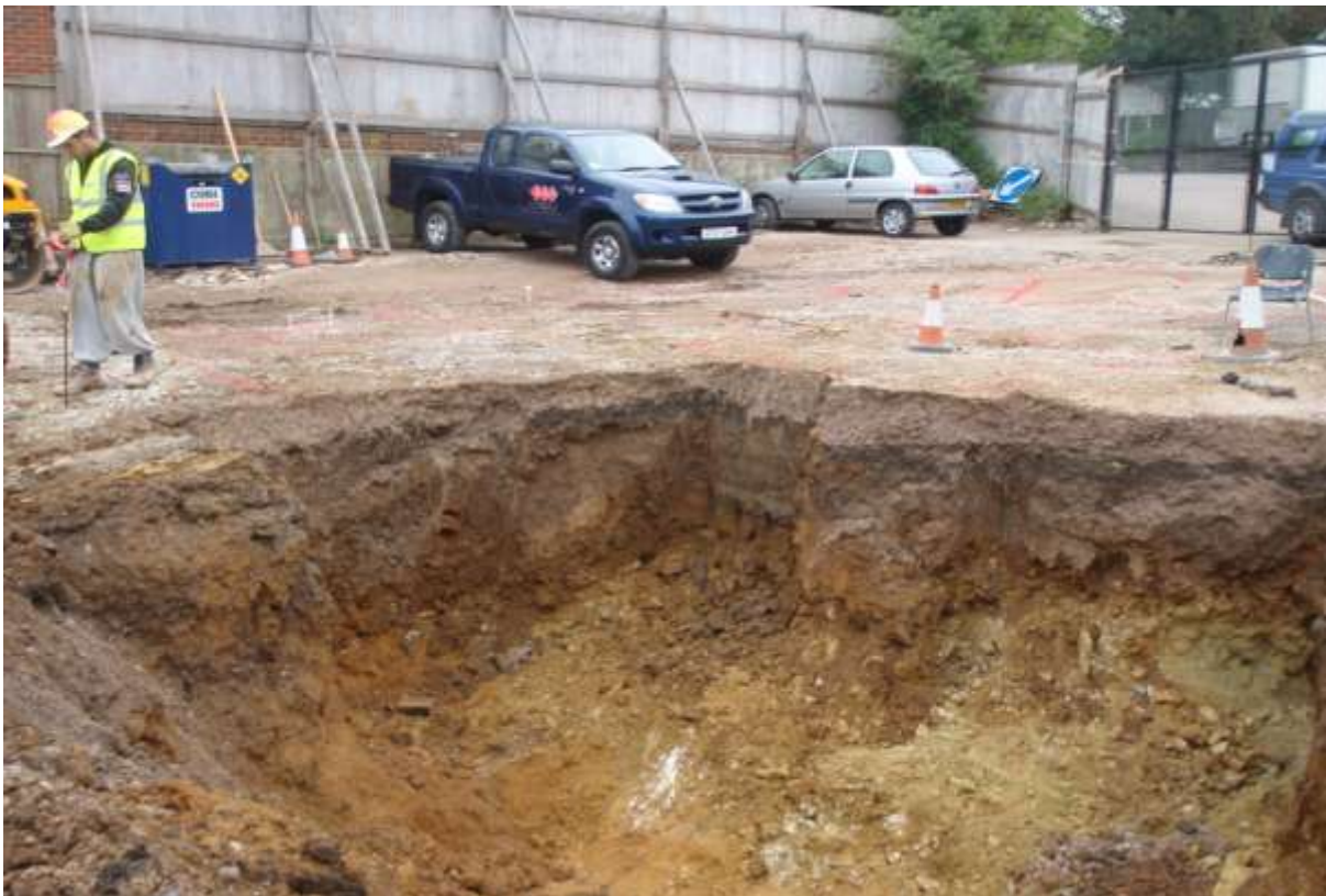
Plate 6. View of exposed geology in deep footings (looking NNW)