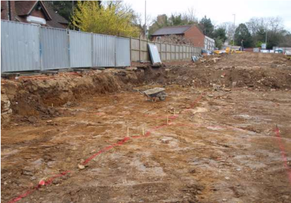
Plate 3. Phase 1. Ground reduction on west side of site (looking NNW)