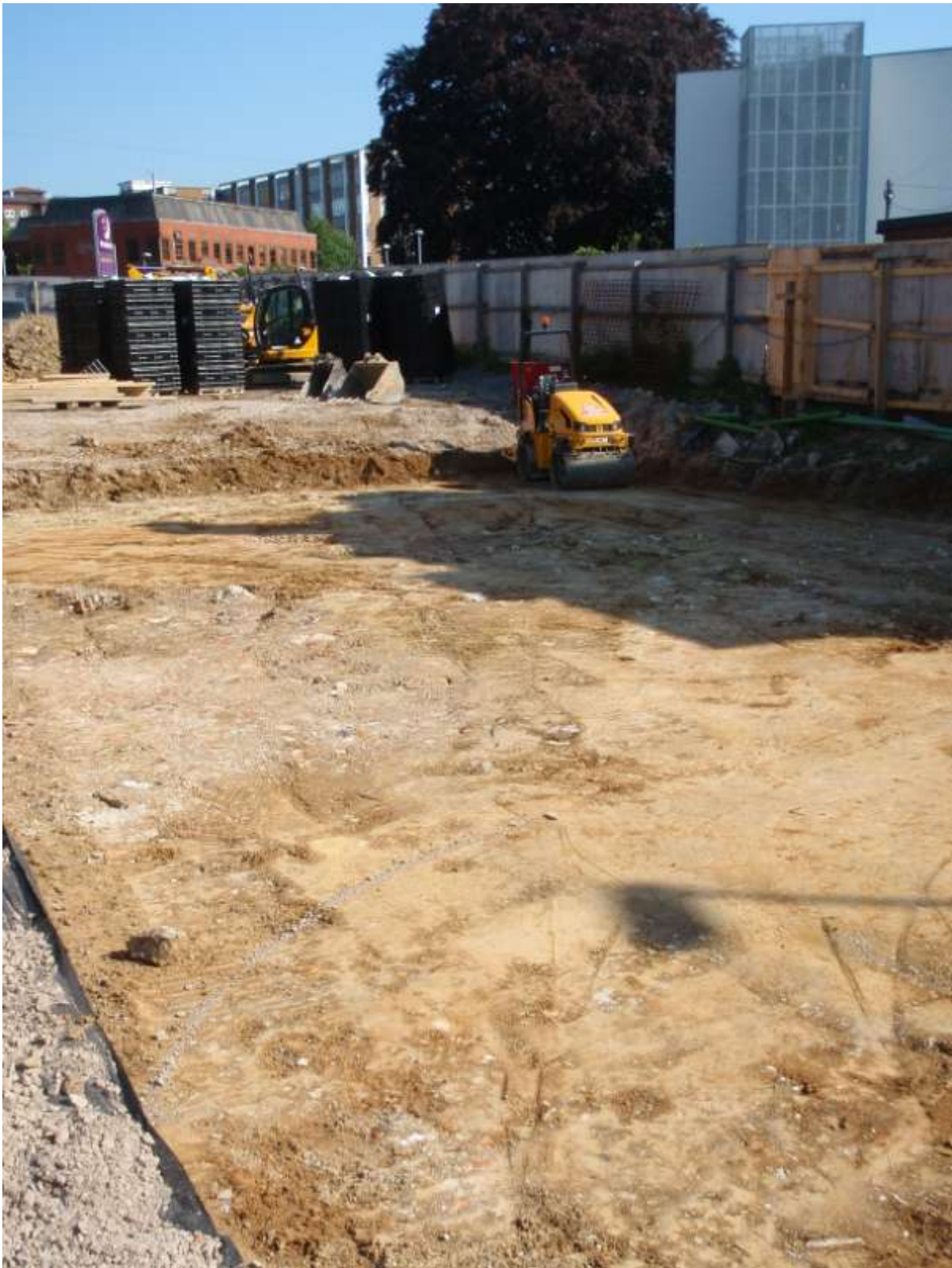
Plate 2. Phase 1, view of the site after tarmac and part subsoil strip (looking NNE)