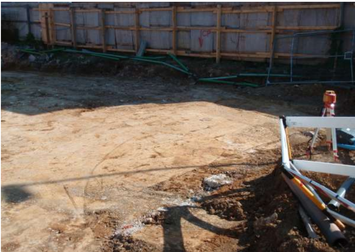
Plate 4. View of site showing reduced level