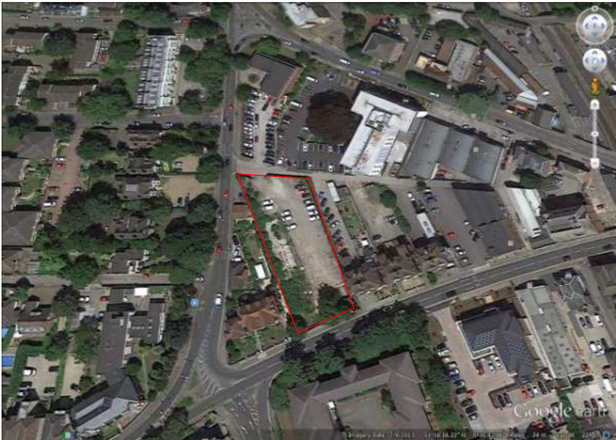
Plate 1. Aerial view showing the site prior to development.