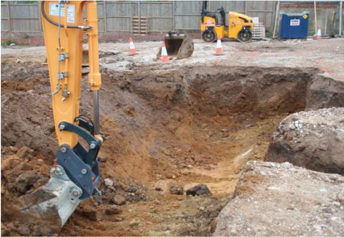
Plate 5. Phase 2. View of deep footings (looking east)